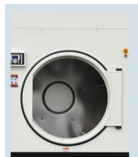
Big opeing door