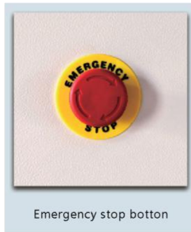
Emergency stop button