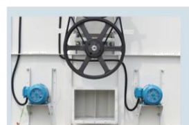
Dual fan motor