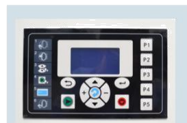
Professional control board