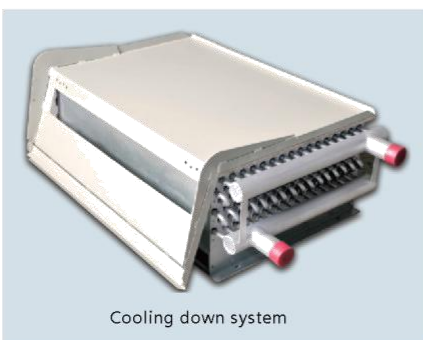
Cooling down system